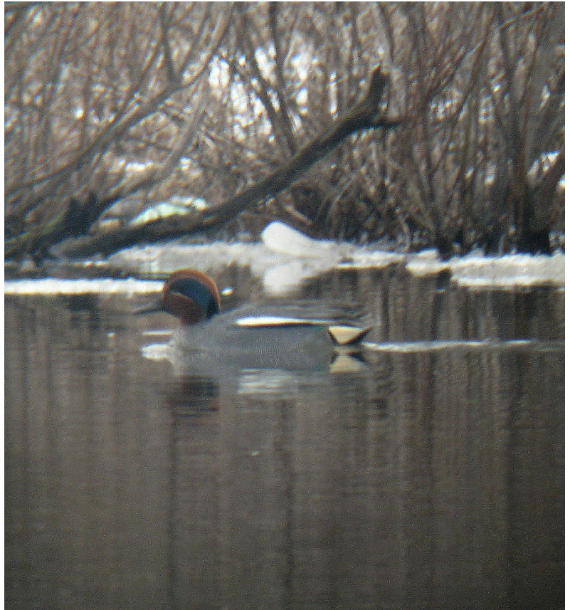
Green-winged Teal (Eurasian).jpg